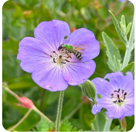
Agapostemon virescens , the bi-colored striped sweat bee, foraging on Geranium maculatum .

Connecticut is home to 388 recorded bee species, covering 43 genera and six of the seven bee families. These bees come in all different colors, shapes, and sizes. Bees also display a variety of distinguishing traits: for example, their social behaviors, nesting habits, and diet breadth. Let's get to know the bees of Connecticut by examining their traits!